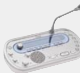
DCN Next Generation Interpreter Desk