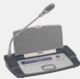
DCN Next Generation Conference Unit

The Bosch Integrus is complemented by other Bosch product families which support discussion, presentations, decision-making and information distribution. The DCN (Digital Congress Network) is ideal for situations ranging from small-scale meetings right up to major international congresses with thousands of delegates. DCN discussion equipment offers the same high quality but is optimized for small-scale gatherings and discussions. The CCS 800 Ultro is a versatile, economical solution for conference control in small- and medium-sized meetings.